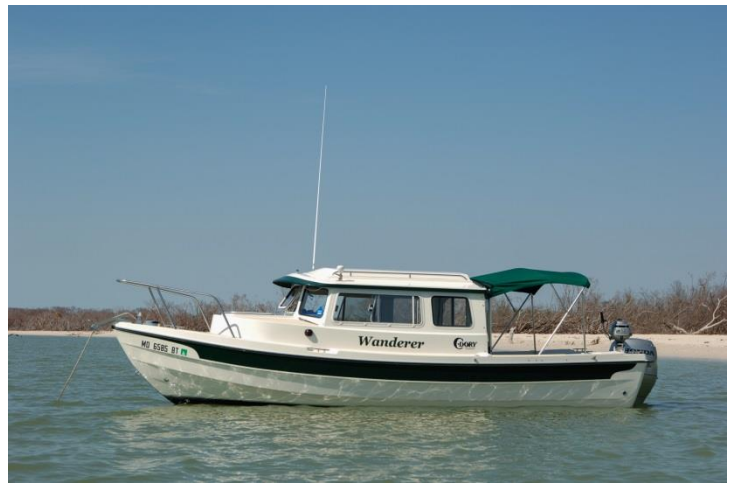
East Cape Sable