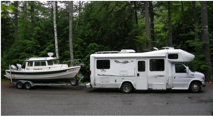
Boondocking Sebago Maine