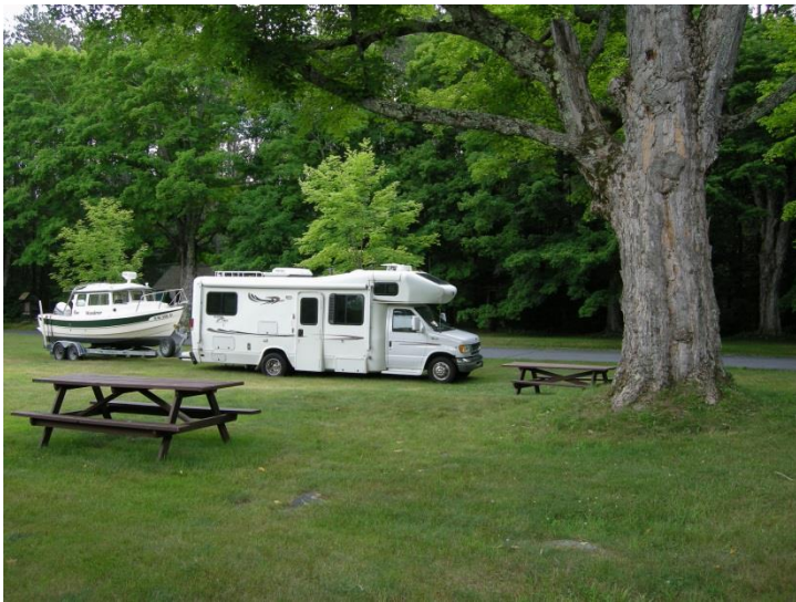
On way to Stonington Maine