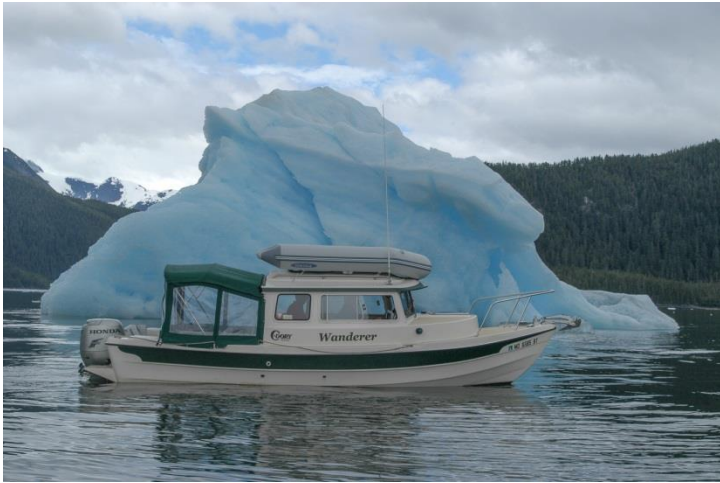
Off LeConte Glacier Alaska