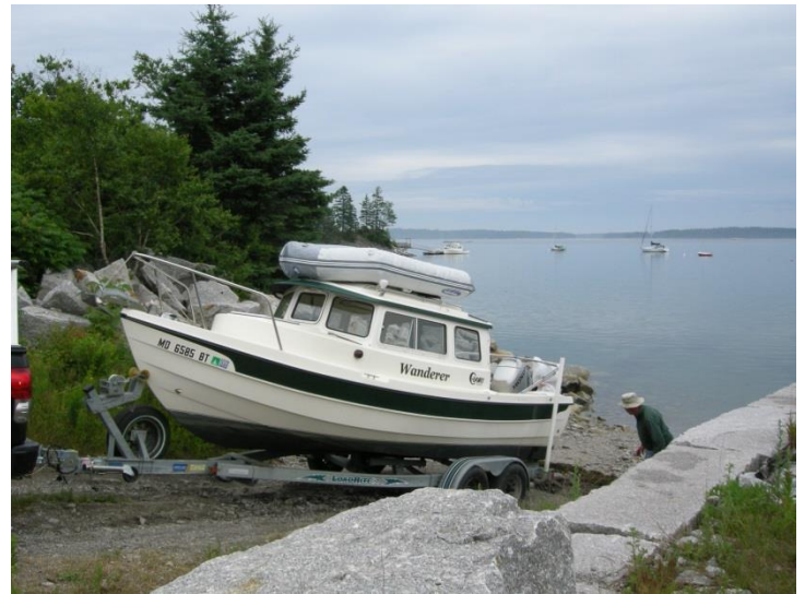
Launching at Old Quarry Maine