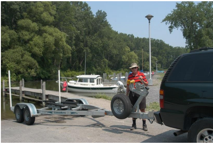
Just launched for Erie Canal