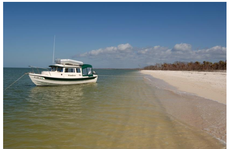
East Cape Sable-off Everglades National Park