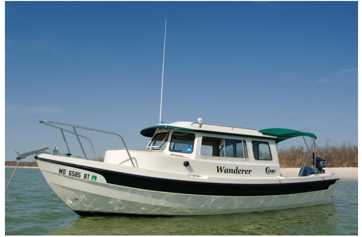
East Cape Sable, Florida