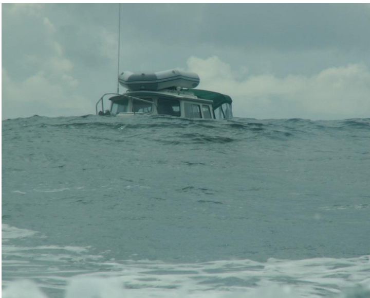
Near Craig Alaska